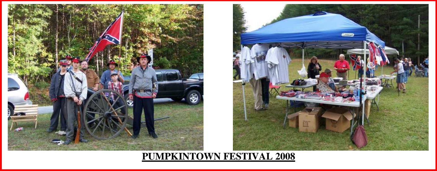
PUMPKINTOWN FESTIVAL 2008

Lt. General Stephen Dill Lee, Commander General United Confederate Veterans New Orleans, Louisiana, April 25, 1906